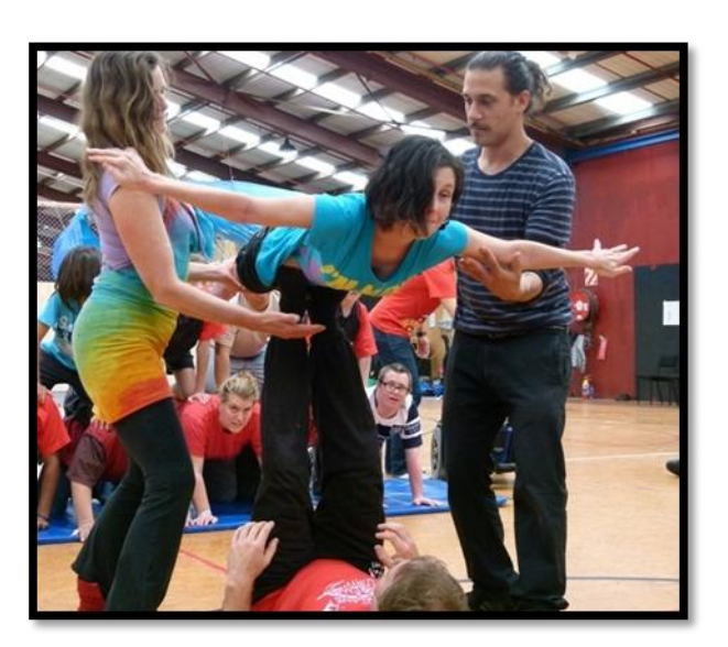
Interact Disability Festival, 2011, Auckland

Jancovich's 2007 study of the youth circus sector in the UK found that "the sector reaches a diverse range of social, cultural and ethnic groups and in particular demonstrates strength in working with learning disabled young people, developing concentration skills and manual dexterity."